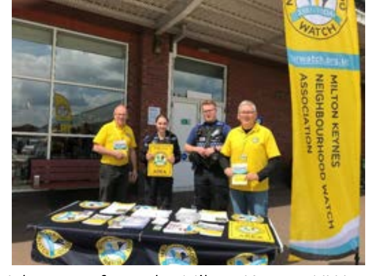
Volunteers from the Milton Keynes NW Association went on tour in the local area to raise awareness and engage with residents!